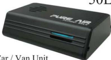
Small Car / Van Unit