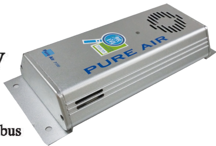
Public light bus & coach